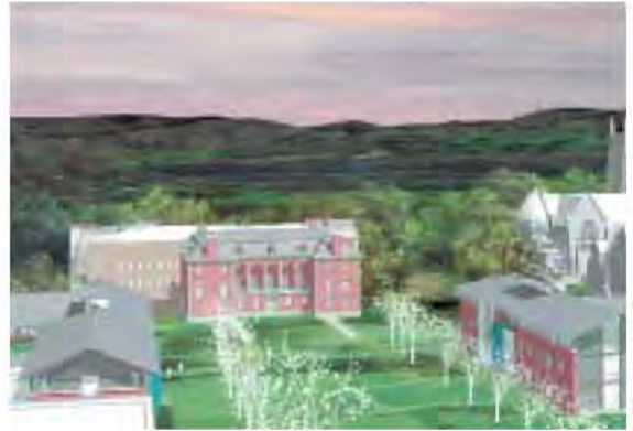
Bohlin Cywinski Jackson